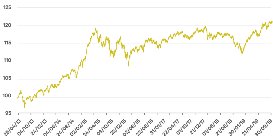
Figure 1: Performance of Davy Cautious Growth Fund at 30th September 2019