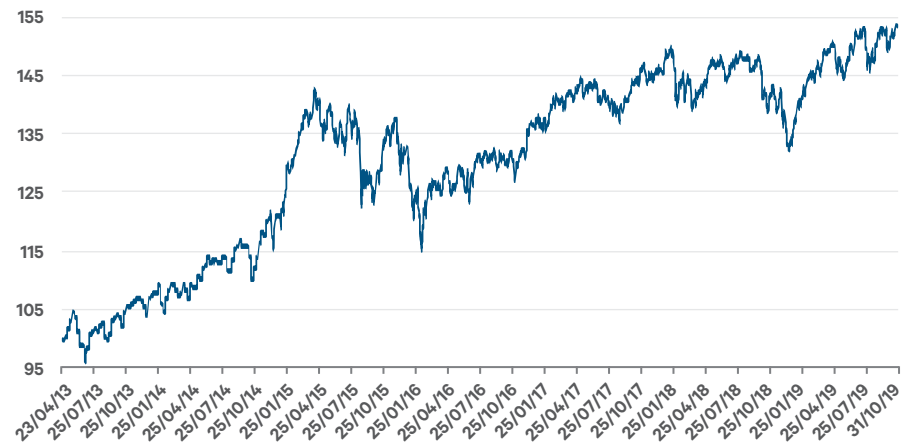
Figure 1: Performance of Davy Long Term Growth Fund at 31st October 2019 6

Warning: Past performance is not a reliable guide to future performance. The value of your investment may go down as well as up. This product may be affected by changes in currency exchange rates.