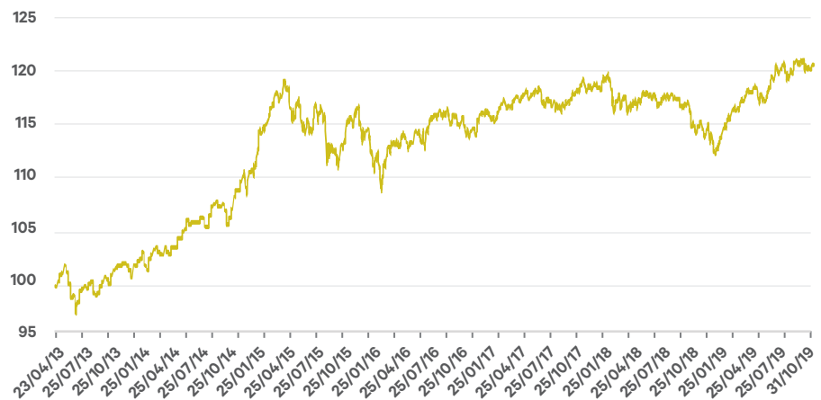
Figure 1: Performance of Davy Cautious Growth Fund at 31st October 2019 6

Warning: Past performance is not a reliable guide to future performance. The value of your investment may go down as well as up. This product may be affected by changes in currency exchange rates.