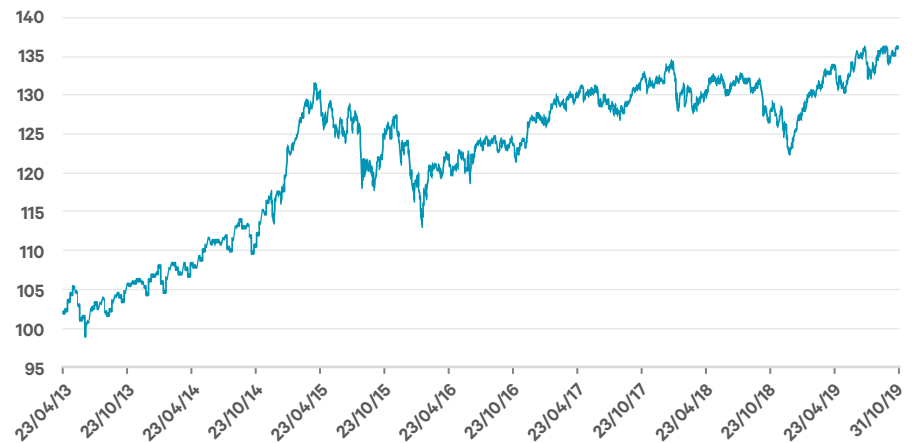
Figure 1: Performance of Davy Balanced Growth Fund at 31st October 2019 6

Warning: Past performance is not a reliable guide to future performance. The value of your investment may go down as well as up. This product may be affected by changes in currency exchange rates.